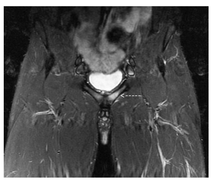
Figure 3 An MRI (STIR sequence) of symptomatic soccer player groin. Grade III bone marrow oedema (arrow) is demonstrated in the left pubic symphysis with an adductor longus injury (bright signal below pubic bone).

Four clinical entities involved in the long-standing groin pain were recently described as pubic-, adductor-, inguinal canal- (with or without rectus abdominis injuries) and iliopsoas-related groin pain. <sup>15</sup> The advantage of pelvic MRI is to detect concurrent injuries, as in our study (proximal hamstring, rectus femoris or gluteal muscle tears). Laxity of the posterior wall of the inguinal canal can be studied clinically using finger/coughing test, by ultrasound or by using